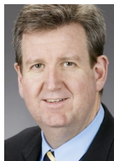
Barry O'Farrell MP NSW Opposition Leader