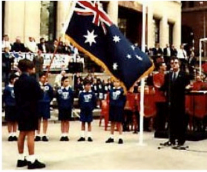
1980s Flag Day – Martin Place (Left)