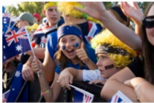
Our Flag at sport

The 2015 Annual General Meeting of the Australian National Flag Association will be held in the ANFA office 3 rd floor ANZAC House 245 Castlreagh Street, Sydney, Wednesday 23 September at 10.30am. Morning Tea will be available. All Members invited to attend.