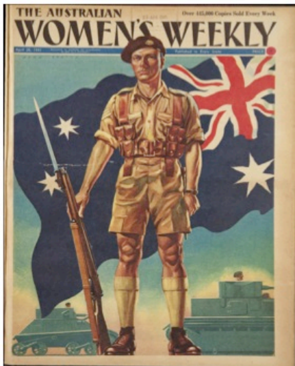
Australian Army Sergeant guards our Flag WWII