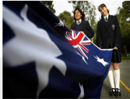
School students raise The Standard