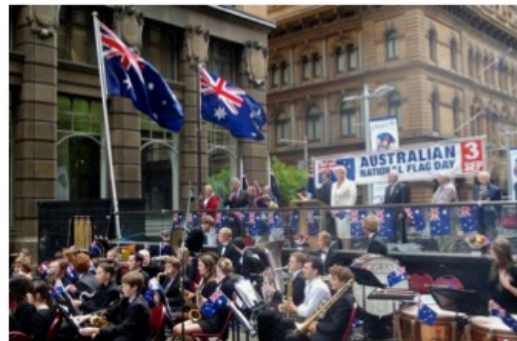
Flag Day – Martin Place