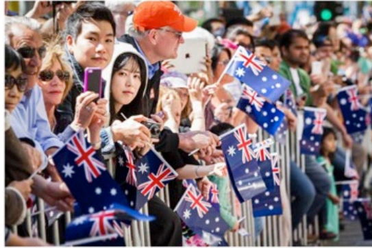
The Australian National Flag has crowd appeal