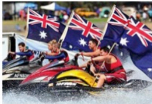
Flying The Flag afloat