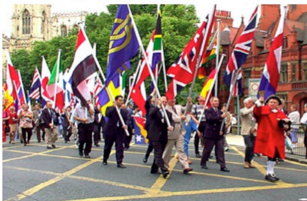
Flag parade Congress of Vexillology at York: Courtesy The Flag Institute

(Left & below) Sgt. Tom "Driver" Derrick VC silenced ten enemy posts at Sattleberg, New Guinea in November 1943. In recognition he was awarded the highest military honour - the Victoria Cross for Valour. He raised the Australian flag in victory at the top of a tall tree.