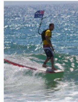
The Australian Flag rides the crest of a wave

Lord Mayor, Clover Moore was the first to forward her message which includes this statement, "Australia has become a dynamic, prosperous, and inclusive nation under the banner of our National Flag. It is a powerful symbol of our young nation and all that we have achieved, and is a poignant reminder of the struggles and dangers our nation has faced under the flag, especially during times of war. Since it was first flown on 3 September 1901, the National Flag has inspired Australian men and women to strive for excellence. It is emblematic of our shared identity as Australians, whatever our differences".