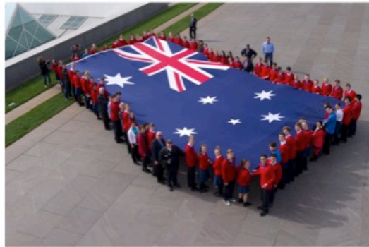
Students honour our flag (Above)