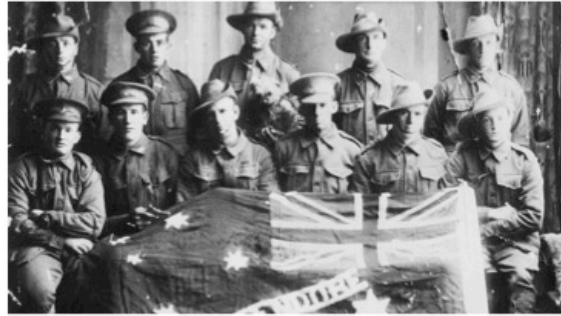
Our AIF Servicemen Bungendore NSW