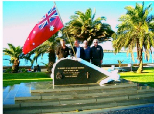
Newcastle Memorial to those who served under the Red Ensign in Australia's Merchant Navy