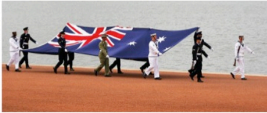
Our Armed Services honour Australia's National Flag